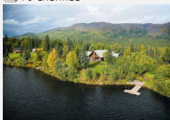
Within the Wild

Winterlake Lodge overlooks Winter Lake, about 200 miles from Anchorage, Alaska.