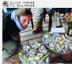
Within the Wild Tourists dine on fresh oysters and wine on the deck at Tutka Bay Lodge, near Kachemak Bay State Park.

Tutka Bay Lodge , a luxury wilderness lodge near Kachemak Bay State Park, is open from early May through September. New owners Carl and Kirsten Dixon (owners of Winter Lake Lodge) emphasize service, fine food, bird-watching, fjord exploration, sea kayaking, hiking, mountain biking, fly-fishing and saltwater fishing. Cooking classes, yoga and spa treatments are planned. The lodge accommodates up to 25 guests in six double cabins, each with a private bath. Children are welcome. Average daily rate per person is $842 (based on $3,365 for a four-day, four-night stay).