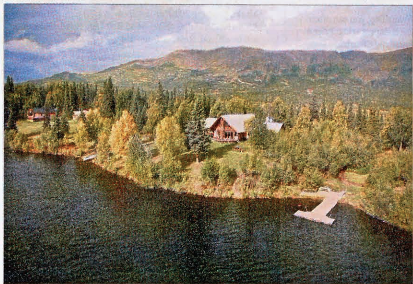
Within the Wild