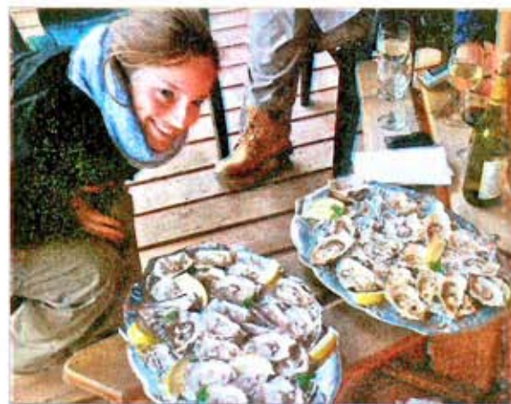
Within the Wild

Sadie Cove Wilderness Lodge , inside Kachemak Bay State Park, is accessible from Homer by boat. Partly-inclusive vacations include owner-guided ecology tours on private trails, hikes to alpine valleys and the Harding Ice Field, clamming, beachcombing, kayaking, fishing and birding. Optional activities such as bear-watching and flight-seeing can be arranged. The lodge is wind- and water-powered. A maximum of 10