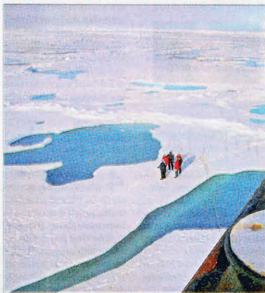
From an icebreaker, passengers venture onto sea ice.