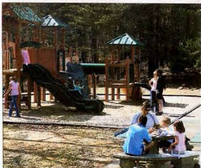
Fall Creek Falls State Park

One of the highest waterfalls east of the Rockies, the main falls drop 256 feet into a deep gorge.