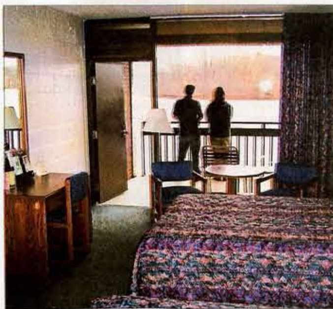
Fall Creek Falls State Park

Hunting trails were linked to form a 25-mile network of hiking trails.