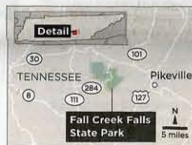
KYLE ALCOTT/Staff Artist

For a copy of the Tennessee State Vacation magazine, call 1-800-462-8366.