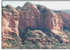
The natural beauty of morning clouds giving way to blue skies over Red Rock country at Sedona is part of a breathtaking trip to the mountains of Arizona.