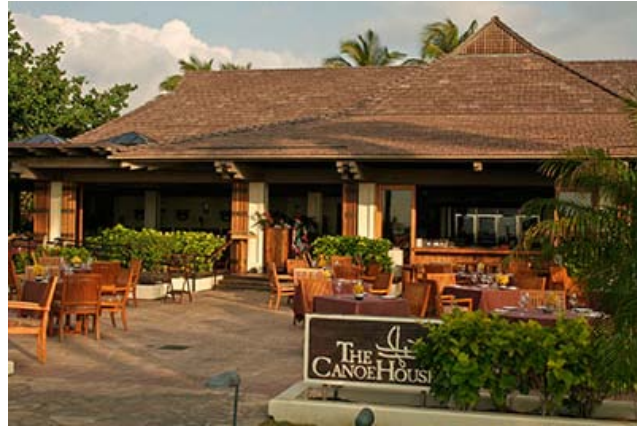
Romantic Dining in the restored Canoe House, at the Mauna Lani Bay Hotel