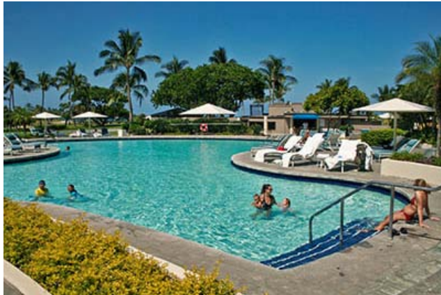
Early Bird Guests Swim Laps while the pool is still quiet. At the Mauna Lani Bay Hotel, Big Island

A classic property built in 1983, the 343-room Mauna Lani Bay Hotel defines most of the features that still give Hawaiian hotels their Polynesian feel. The terraced front facade, an innovation back in the day, looks dated. But the airy high-ceilings, open-air lobby, lush gardens and tropical flowers are still de rigueur, as is the inviting figure-eight pool and rambling pool deck.