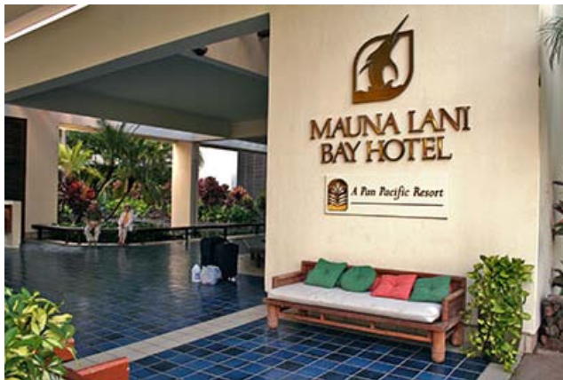
You know when you've arrived at the Mauna Lani Bay Hotel, on the Kohala Coast.