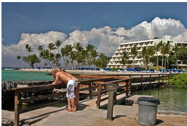
View of the Mauna Lani Bay Hotel as seen from across the Bay and the start of the historic Kalahuipua'a Trail

Check Out The 2011 Aloha Room Rates at the Mauna Lani Bay Hotel & Bungalows, on Hawaii's Big Island.