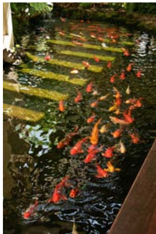
Koi in the lobby pool are the only non-native fish in the Mauna Lani Bay Hotel's fish ponds

Its neighbor to the south, also on private Mauna Lani Resort property, isn't a hotel, but a 1,800-acre historic preserve named Kalahuipua'a with ancient fish ponds, fresh-water springs, historic trails and an unspoiled shoreline. Northward is the Puako Petroglyph Field, the largest in the state of Hawaii. It's hard to imagine any other place, even in Hawaii, so scenic and secluded.