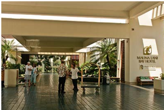
A quiet moment in the lobby of the Mauna Lani Bay Hotel, Big Island

What about hidden charges, those daily resort fees and sports rental charges? Happily there are none. Unlike its competitors, the Mauna Lani Bay Hotel includes nearly everything in the room rate, from a host of in-hotel amenities to the use of sports facilities and equipment. No matter what takes your fancy, from the Fitness Club, swimming pool, towels, beach cabanas, kayaks and stand-on paddle boards, (the latest craze) to snorkel gear, tennis court and recreational bicycles, all are provided at no extra fee.