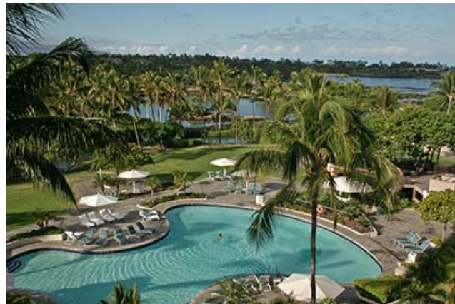
The pool, palm groves and ancient fish ponds at the Mauna Lani Bay Hotel, on the Big Island's Kohala Coast

But ask one of the regulars, and they'll say that the Mauna Lani Bay Hotel's 20-acre grounds are its chief asset. One of the earliest hotels built on the Kohala Coast , the Mauna Lani occupies one of the few sites with a protected cove and a curving sweep of natural sand beach.