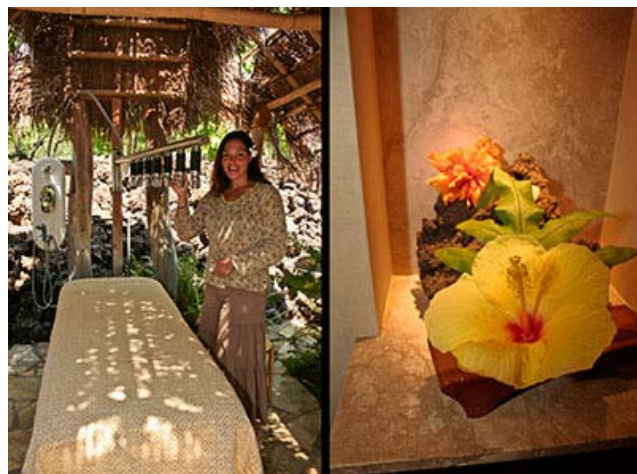
To the left: A secluded bower becomes a massage room at the Mauna Lani Bay Spa, on the Resort grounds. To the right: Yellow hibiscus are