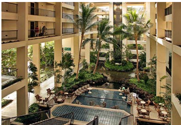
Open-air breezes, tropical gardens and terraced fish pools transform 1980 retro arcitecture into a magic forest

What other hotels can't brag on, however, is the Mauna Lani's open atrium and its terraced tropical fish pools, continuously refreshed by a gentle waterfall. A salt-water ecosystem of jewel-like fish dart hither and yon in pools so artfully contrived that watching the fish close up is almost as good – but not nearly so easy – as donning diving gear to explore the nearest reef. A tip: Start your day with breakfast served at a Terrace table.