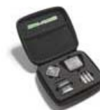
Mother's Day Vehicle Gifts – Mother's Day Vehicle Gift Guide