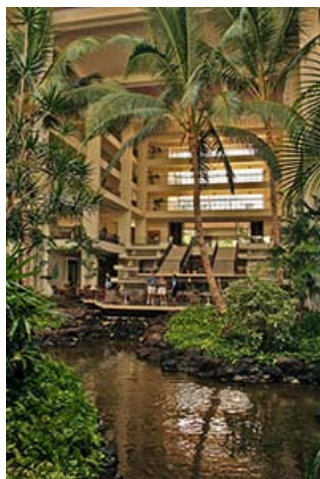
Lush atrium gardens and sal-water fish ponds mesmerize impressed guests at the Mauna Lani Bay Hotel, on the Big Island's Kohala Coast

What about hidden charges, those daily resort fees and sports rental charges? Happily there are none. Unlike its competitors, the Mauna Lani Bay Hotel includes nearly everything in the room rate, from a host of in-hotel amenities to the use of sports facilities and equipment. No matter what takes your fancy, from the Fitness Club, swimming pool, towels, beach cabanas, kayaks and stand-on paddle boards, (the latest craze) to snorkel gear, tennis court and recreational bicycles, all are provided at no extra fee.