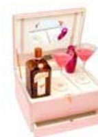
Mother's Day Food & Beverage Gifts – Mother's Day Food & Beverage Gift Guide 2011 Over $15