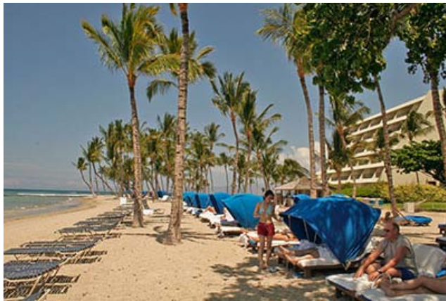
Summer time on the beach at the Mauna Lani Bay Hotel, on the Big Island's Kohala Coast

Celebrating Hawaii's 50 years of statehood, the Mauna Lani Bay Hotel is saying farewell to 2010 to welcome the New Year with the most affordable lodging rates and packages seen in recent years. Standard rooms for two on select dates over the next couple of months are going for $278 per night, nearly 20% off high-season prices. If you're feeling flush, consider a deluxe room, also at discounted rates. Availability is limited, however, so keep checking the hotel's website (at www.maunalani.com/ ).