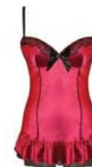
Mother's Day Hot Lingerie & Sleepwear Gifts – Mother's Day Lingerie & Sleepwear Gift Guide 2011