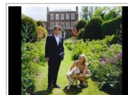
Everybody Eats Where? Everybody Shops