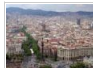
Priciest World Cities