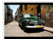
Retro Roaming: Tips for a Vintage Vacation