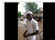
Senegal's Accidental Hipsters