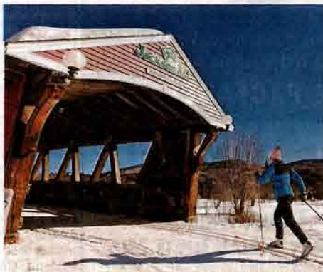
JACKSON SKI TOURING FOUNDATION

GOING DOWN: A little skier at Steamboat, above; a veteran takes on Arapahoe Basin's Slalom Slope, top.