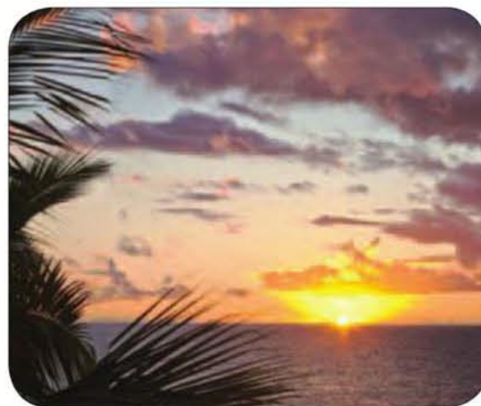
The sun sets over the lagoon in the Mamanuca Island Group, Fiji.

Castaway is hard to forget. But truth to tell, it's just one of many resorts in the Mamanuca Group, each with its own style. If you visit here you'll have to pick one, since