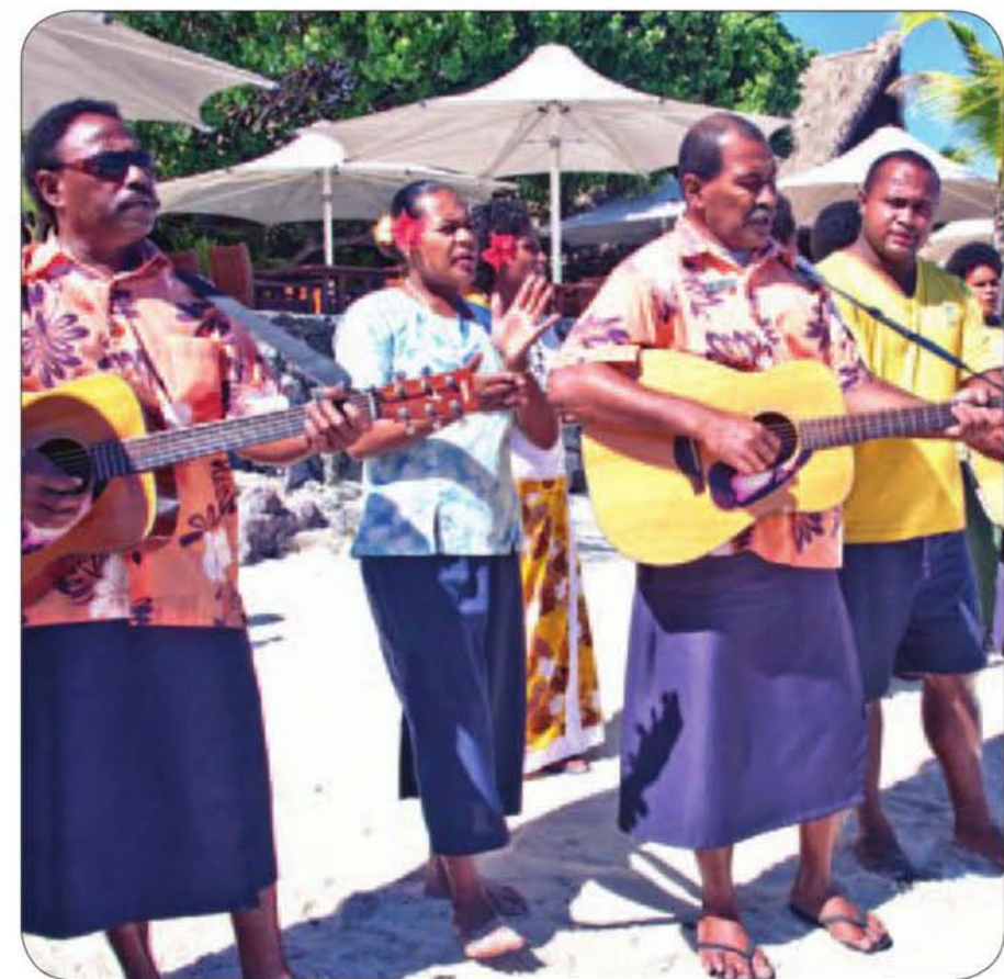
The staff sings a welcome song as visitors arrive at Castaway Resort.

The Mamanucas are poster-perfect. But the main island, Viti Levu, is the cultural and commercial heart of Fiji. Here we checked into the hotel Outrigger On The Lagoon, on the Coral Coast, our base for exploring. Told that Fijian choirs excel and anxious to hear them, we decided to attend a Sunday service at a tiny Methodist church. The 12-person choir, mostly elderly, looked tired and wan. And when