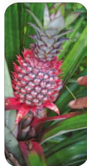
The native Fijian pineapple looks just as good as it tastes.

Turning over, I looked down, and said (silently, into my snorkel), "Wow!" We've seen some pretty special coral over the years. But the Malolo Reef, 75 feet high over the ocean floor, was more fantastic than any animated film. Below me, thousands of hard and soft corals of every shape and color crowded together, swaying gently with the tide. Here was a ribbon of pinks, blood red and soft purple; there a swirl of electric green, custard yellow branches and chocolate brown leaves. For an hour we floated to and fro, enchanted, until Tagitagivalu touched my shoulder and broke the spell. With the tide turning and the waves breaking, we hurriedly swam back to the boat.