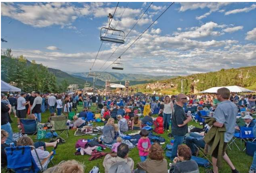
Free weekly concerts bring visitors and residents together for a picnic and music under the Fanny Hill chairlift, at Snowmass Village, Colo.