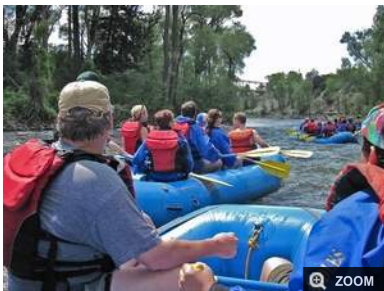
Activities at Snowmass resort include whitewater adventures on the Roaring Fork River. And fly fishing lessons are great for the kids.

I’m a skier, so snow is what comes to my mind, too. But after last summer, I’ll never think of Snowmass the same way. We floated the idea of a two-family vacation in March, but procrastinated until June.