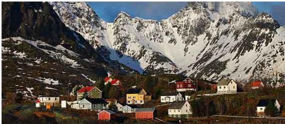
Fishing Village on Island of Moskenes on Lofoten Islands, Norway. (Michael Mellinger, Getty Images / July 28, 2012)

By Anne Z. Cooke, McClatchy-Tribune News Service (MCT)