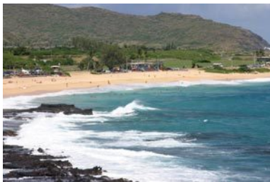
OAHU VISITORS BUREAU Sandy Beach on southeast Oahu is where President Barack Obama body surfs.

Think of their class picnic, the buffet table laden with parents' contributions: spaghetti, pizza, teriyaki chicken, plate lunches, potato salad, spam musubi (American Japanese), chow mein, malasadas