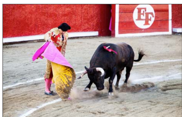
A matador uses his cape to goad the bull into a useless charge at the Plaza de Toros in Mazatlan, Mexico.