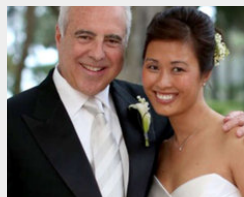
Eagles owner Jeffrey Lurie gets married