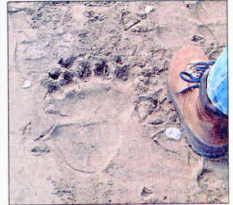
A bear left a 12-inch paw print at Bristol Bay Beach, Alaska.

Flying low over the land, I've seen not just bears but moose, herds of caribou, occasional wolves and swans on their nests. When our flight route crossed ocean inlets I spied pods of white beluga whales cruising at the surface. Flying over Katmai National Park — a favorite bear destination — look for the crater and devastated area around Novar-