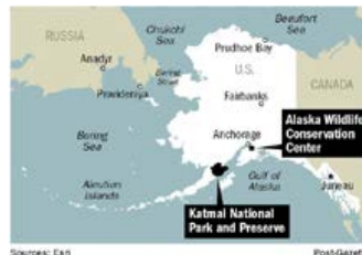
PG map: Alaska (Click image for larger version)