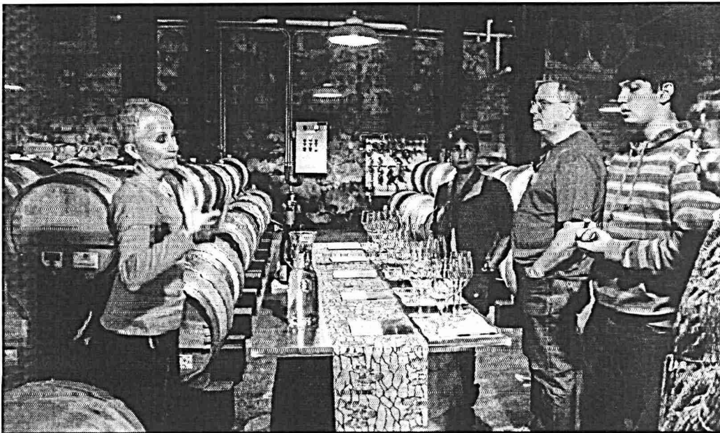
Guests enjoy a tasting flight at Hess Estate's Cellar in California's Napa Valley.

I've now checked off nine Napa wineries. Just 190 to go. An epic journey begins.