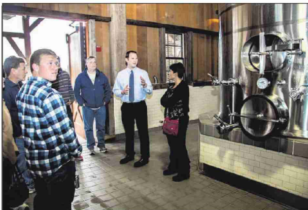
Above, people walk down Washington Street, the main thoroughfare in Napa Valley's Yountville. At left, visitors tour the tank room at Nickel & Nickel winery