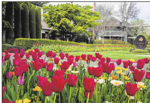
Red tulips bloom in the garden in front of the Vintage Inn in Napa Valley's Yountville.

For Napa Valley information, see napavalley.com .