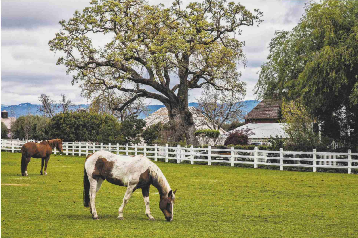
ABOVE: Classic country pastures are part of the landscape at Nickel & Nickel winery and vineyard in California's Napa Valley.