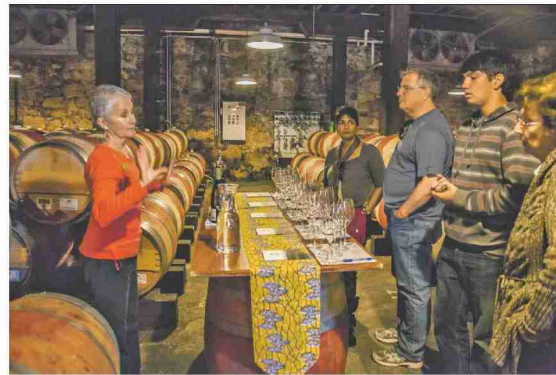
ABOVE: Guests enjoy a tasting flight at Hess Estate's cellar in California's Napa Valley.