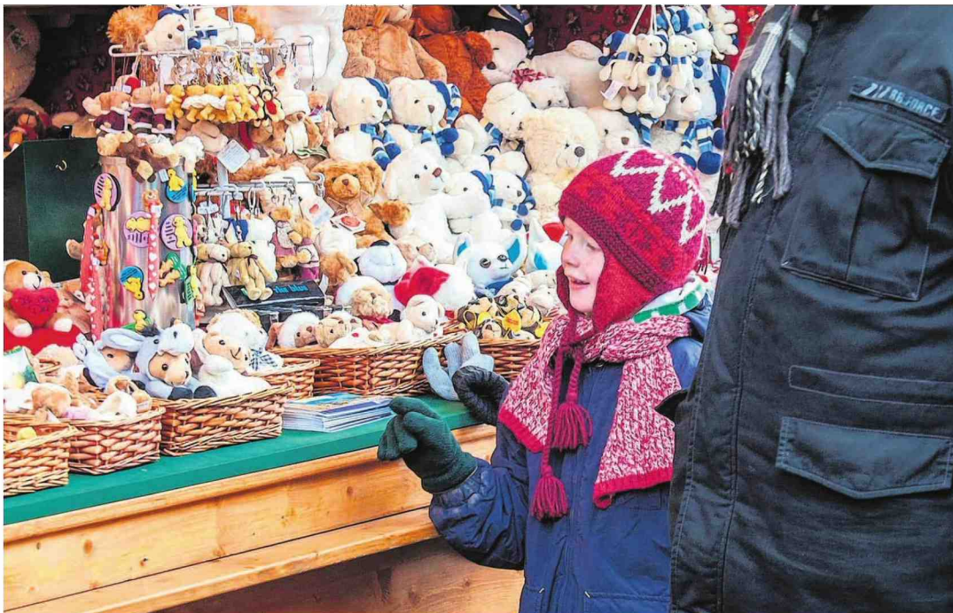
Wares for sale at the markets include toys, gifts and holiday decor – something for everyone.