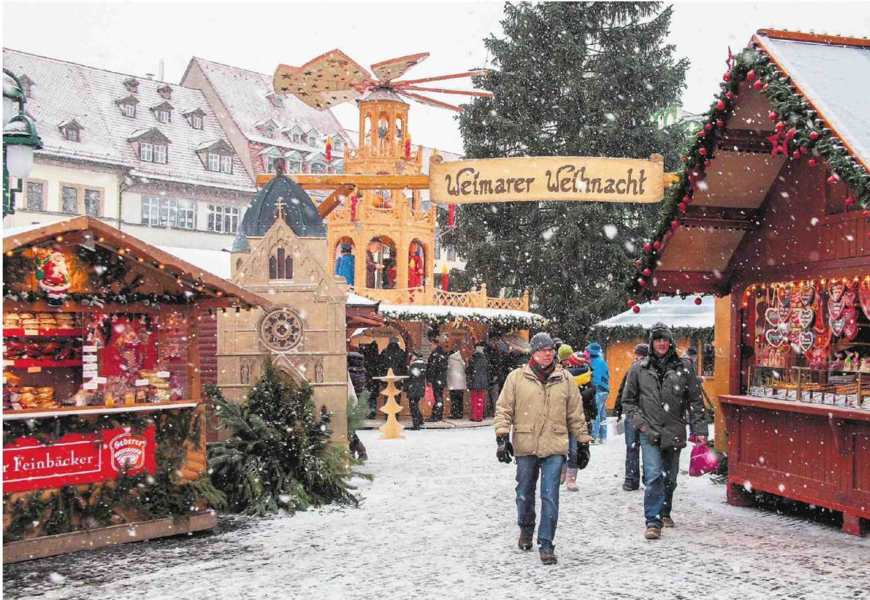
Snow falls in Weimar during its Christmas market. When night falls, thousands of lights complete the seasonal scene.