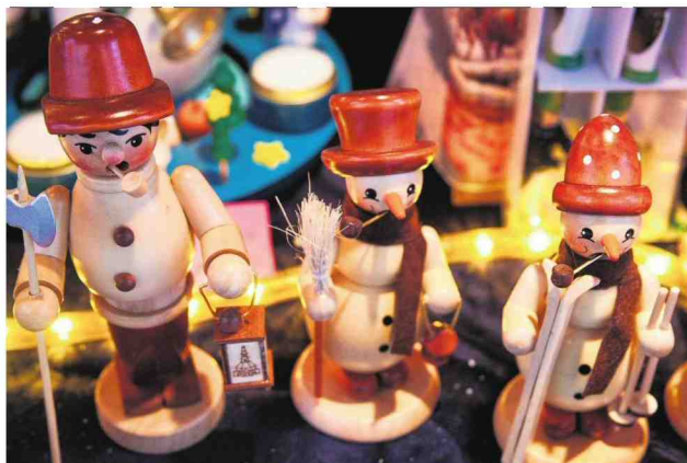
Traditional wood toy figures are sold at the Alexanderplatz Christmas Market in Berlin.