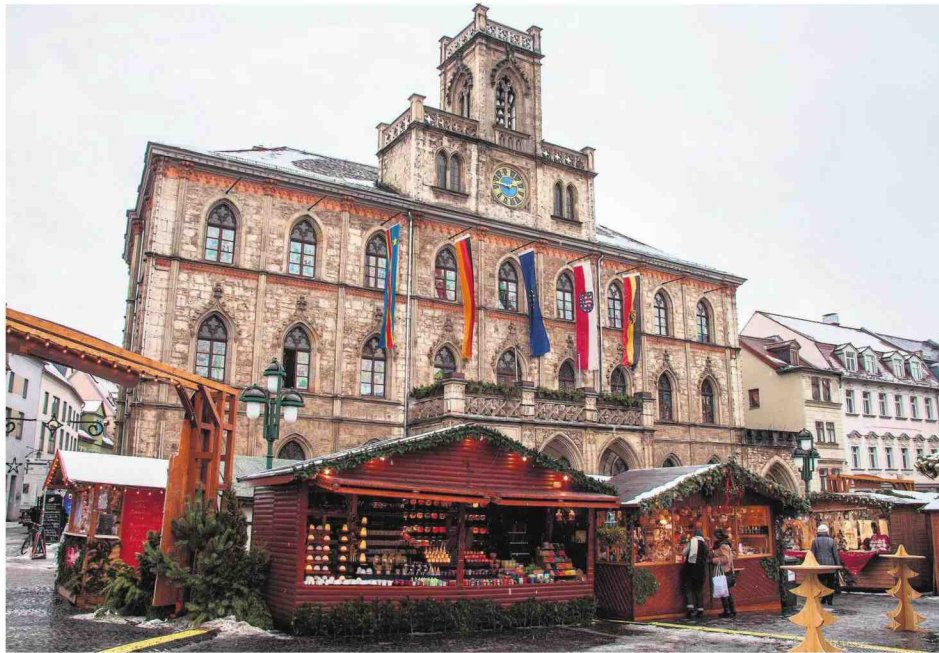
In Weimar, the market is set up by city hall. Other cities feature markets around churches.