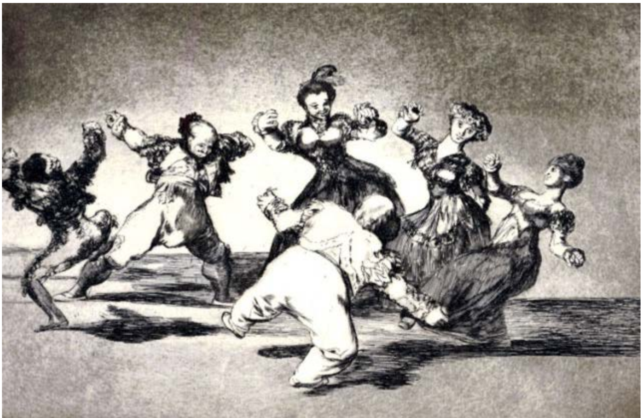
Santa Fe is the only location in America where an exhibition of Francisco de Goya's work is being shown. "Figures Dancing In A Circle" is an etching, aquatint and drypoint done ca. 1816-1824.

PUBLISHED: Sunday, February 2, 2014 at 12:05 am