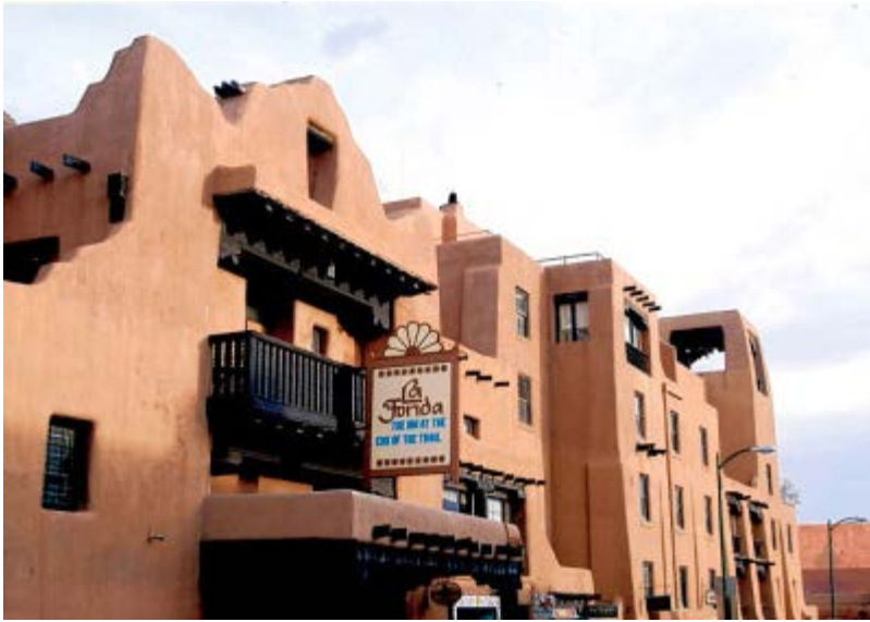
La Fonda in Santa Fe is offering special rates during the "Renaissance to Goya" exhibit at the New Mexico Museum of Art.

And why, you might wonder, did I find a collection of black-and-brown scribbles compelling enough to make a hastily planned trip to Santa Fe to see them before they return to the archives in London's British Museum? Because the La Fonda Hotel on the Plaza, a museum down to its bones (and my heart's own home-away-from-home), was advertising a killer rate for two in a double room, plus a scrumptious breakfast and tickets to the exhibit.