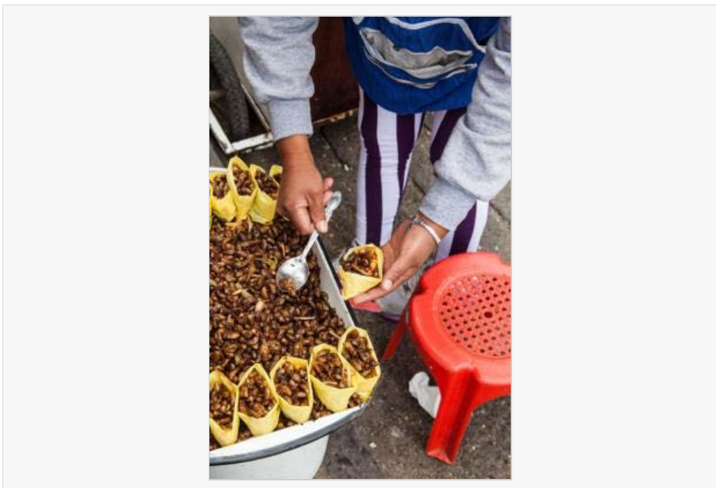
A bag of salted Andean beetles can be purchased for a snack at the market in Otavalo, Ecuador.