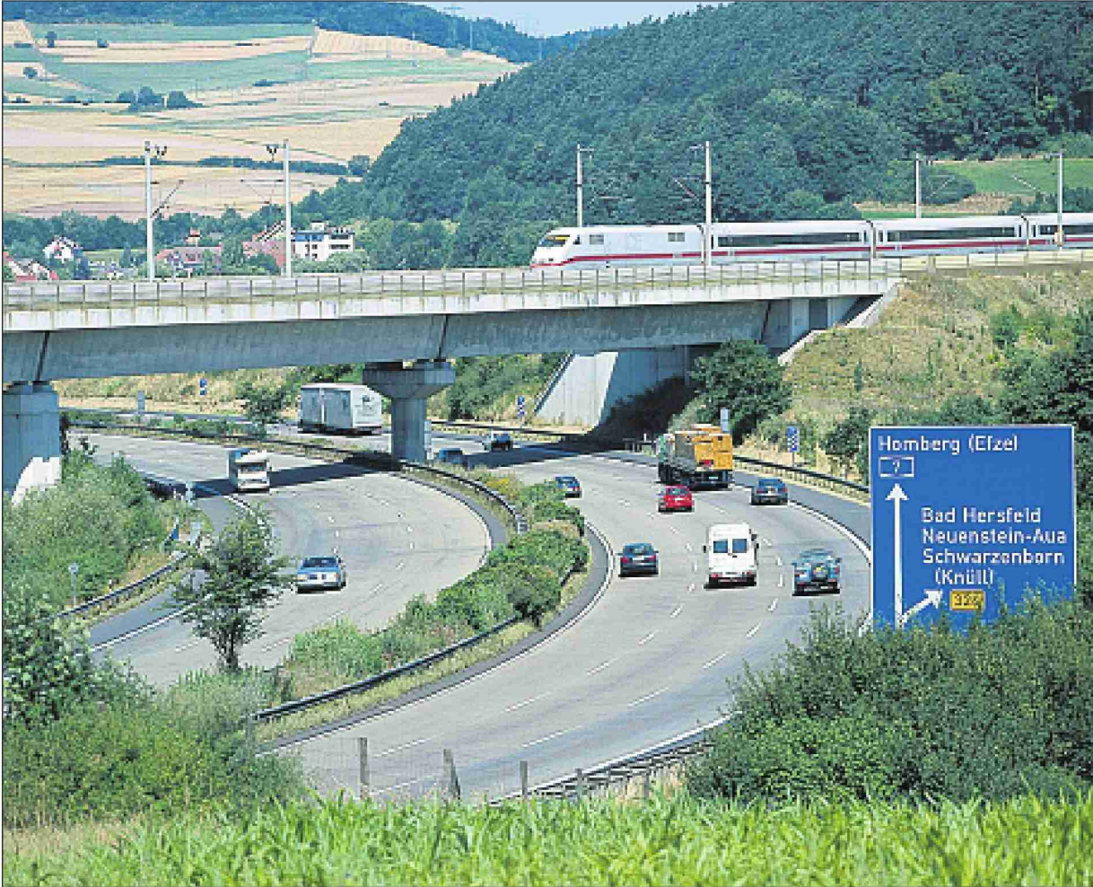
The autobahn and railway with InterCity-Express train near Bad Hersfeld.