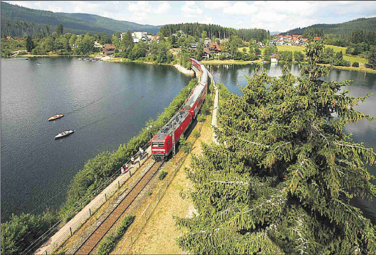
A regional train crosses the Schluchsee near the Black Forest.