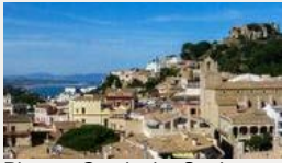
Photos: Catalonia, Spain