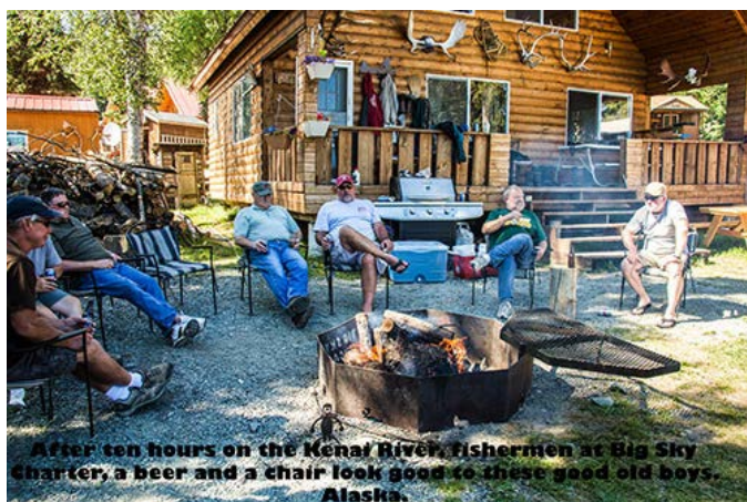
After ten hours on the Kenai River, fishermen at Big Sky Charter, a beer and a chair look good to these good old boys. Alaska.

in contrast to the fishing industry, which supports itself and its workers.