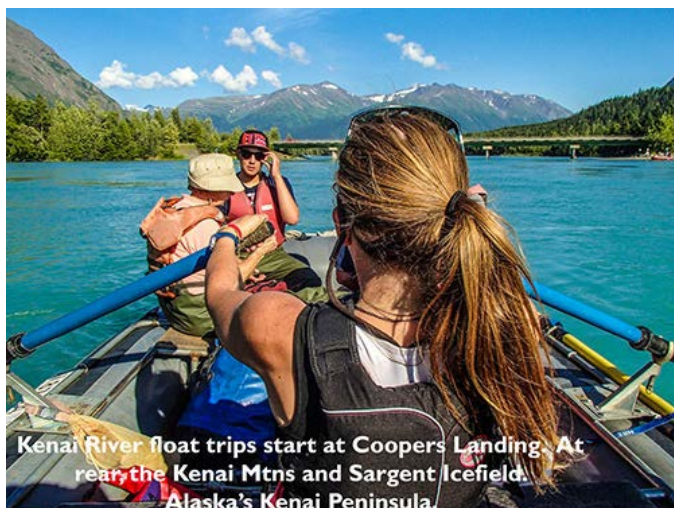
Kenai River float trips start at Coopers Landing. At rear, the Kenai Mtns and Sargent Icefield. Alaska's Kenai Peninsula.

As much fun as the fishing was, it was just a small part of our tour of the tour of the Kenai Peninsula. A mountain wilderness as spectacular as the Tetons and as big as Massachusetts and Connecticut put together, the Kenai is remarkably varied, with a taste of the wonders you'll find elsewhere in Alaska. Here, however, it's in one place, close enough to see in a week, and a couple of hours' drive from Anchorage. There's pre-European and pioneer history, adventure sports, hiking trails, glaciers, bays full of marine mammals and fish, roaring rivers to float or raft, bears, birds, hotels, comfortable lodges, rustic cabins and fresh seafood restaurants on every coast and in every town.