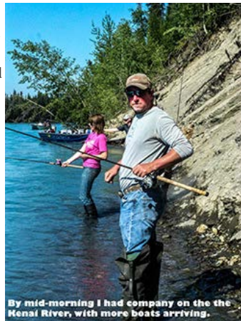
By mid-morning I had company on the the Kenai River, with more boats arriving.

By 9 a.m., the public stretches of the Kenai, on Alaska's Kenai Peninsula, are overrun with fishermen standing 20 feet apart, check to jowl on the mud, between the bushes and in the shallows. It's crazy, chaotic and exciting, a tradition that no "sourdough," aka card-carrying Alaska resident, would miss. But for "cheechakos" like us, visiting Alaska with our kids, eight hours was enough. By mid-afternoon we were done and ready to go when the guide and motorboat came to pick us up.