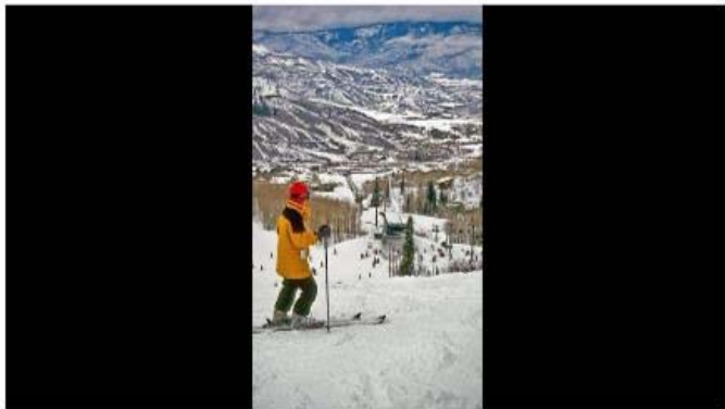
Snowmass Village seen at Snowmass Resort, Colorado.

This article is related to: Hotels and Accommodations, Dining and Drinking, Trips and Vacations, Restaurants, American Airlines