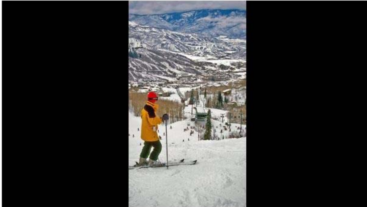
Snowmass Village seen at Snowmass Resort, Colorado.