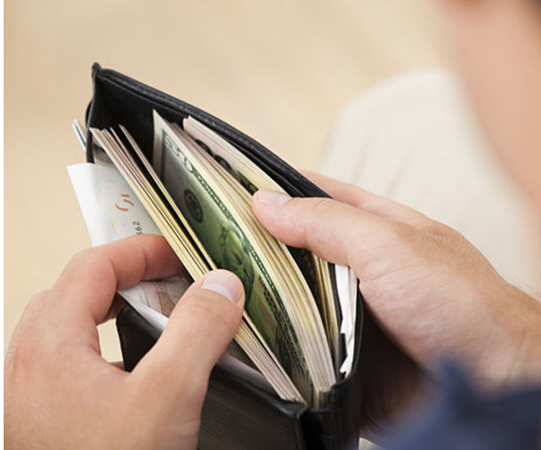
Investment company Wealthfront raises $64 million Reuters | Wealthfront