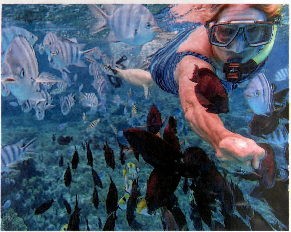
"Every colour of the rainbow," reports the author, snorkelling among the coral in the Bora Bora lagoon.

Since Tikehau's only "pass" through the reef is a narrow gap too perilous for anything larger than a fishing boat, it's likely that Tikehau, where time seems to have stopped, will remain