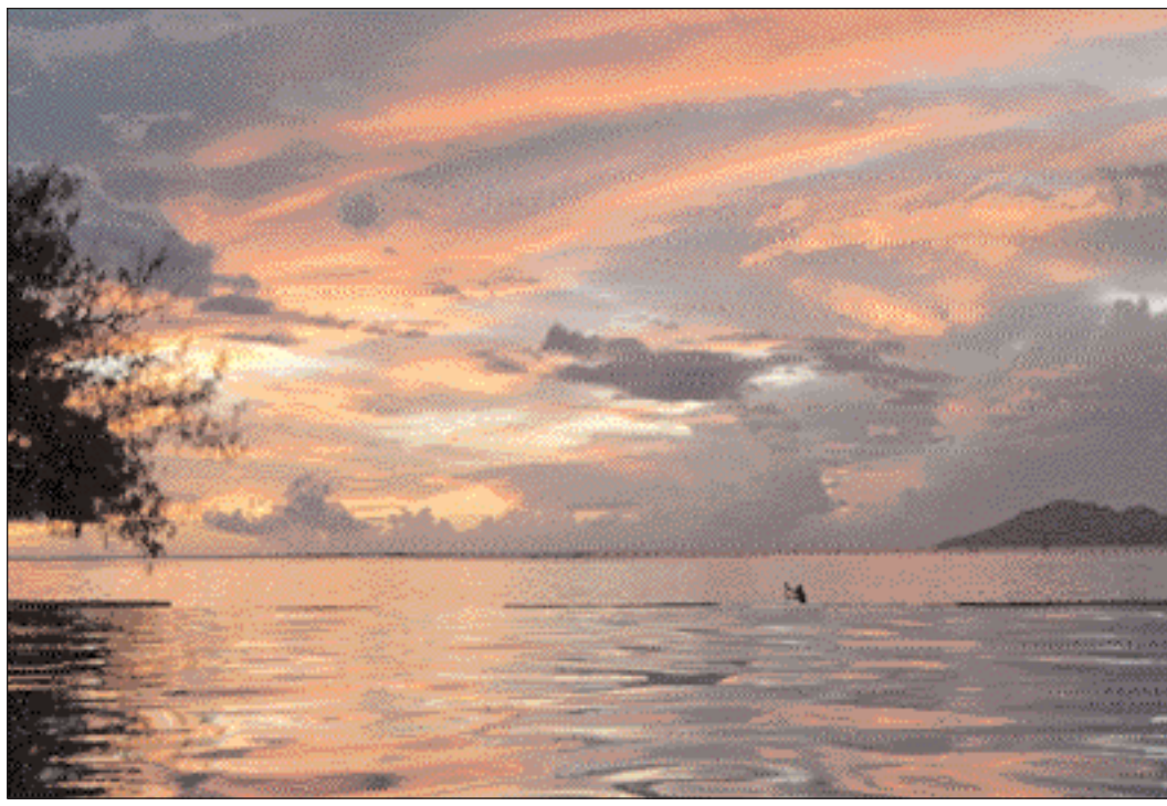
Tribune News Service

I contemplated mountain biking on the lower slopes of 7,352-foot Mount Orohena, highest mountain on Tahiti, and in the Society Islands, but after a closer inspection changed my mind. Instead, I joined a half-day cultural and waterfall truck tour guided by Teiva (he uses just one name), a 12th-generation Tahitian who arrived in festival gear (boar's tusk necklace, green pareo, pony tail and a huge smile).