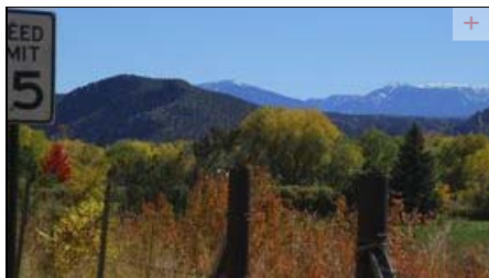
Autumn in the Embudo Valley, near Dixon, N.M.