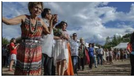
Small it is; sleepy it isn't. Line dancing highlights Dixon's annual summer Fiesta. Dixon, N.M.