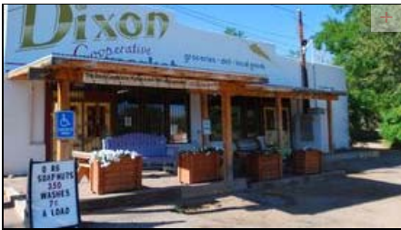
The Dixon Coop, bigger than it looks, sells everything from vegetables to cooking gear, in Dixon, N.M.

From 9 a.m. to 5 p.m. on Saturday and Sunday, Dixon's artists set aside their paints, brushes, pastels, clay, looms, silk screens, lathes and chisels and open their doors to all comers, from browsers and buyers to colleagues and friends. Many of the artists who call Dixon home exhibit their work in galleries elsewhere, in Santa Fe, Taos and beyond. But this is a chance to meet them at home and to see where and how they work.