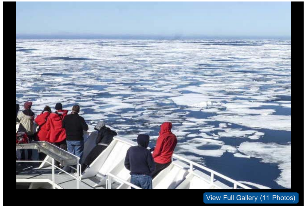
View Full Gallery (11 Photos)