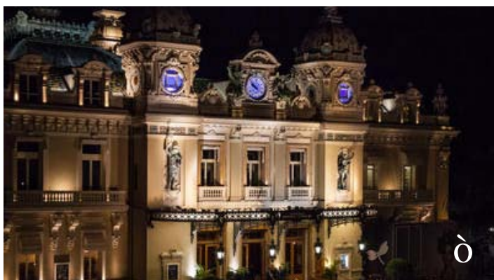
Don't expect to meet the locals in Monaco's Monte Carlo Casino; they aren't permitted to enter or to gamble.

On the Star Breeze, luxury set the pace. But it was the ship's size that felt so manageable. It took me just an hour to explore from top to bottom, learning my way around every space from the decks and the dining room to the lounges, library and the gym.