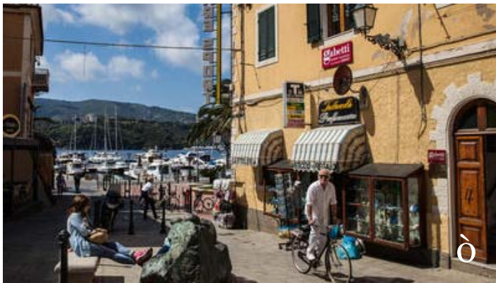
Life moves slowly on the cobblestone streets of Porto Azzurro, island of Elba.

walk-in closet that I don't really need."