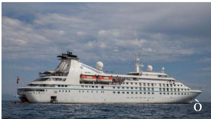
The Star Breeze at anchor in the ocean off Portofino, Italy.

And the shore excursions I'd expected to blow off? Two choices offered rich dividends. The first, a visit to Napoleon's in-town quarters, the gardens, a museum and his country residence, would cure my ignorance. Napoleon, in fact, didn't live on Elba very long, escaping within the year. (More fool he, considering how things turned out.) But the second excursion, a circle-island tour, offered a chance to see the real Elba, geography, topography, warts and all.