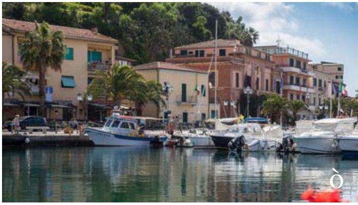
Pleasure and fishing boats share the harbor at Porto Azzurro, on Elba Island, Tuscany coast, Italy.

Expedition ships can be Spartan or deluxe, but they invariably offer demanding or even strenuous shore tours and single-themed trips: Polar bears and Arctic ice; the Amazon jungles,