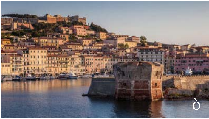
The Linguella Tower, build by the Medici's in the 16th century, shields the harbor at Portoferraio, on Elba, Italy.

unobtrusive. This room, especially, seems brighter.