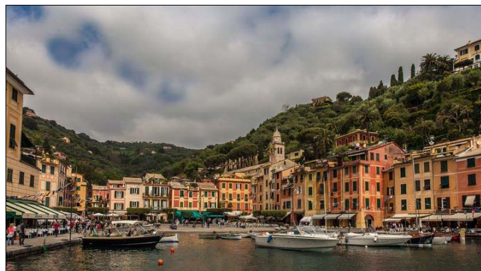
The harbor in Portofino, Italy, is one of the most photographed in the world.

PORTOFERRAIO, Italy — When you sail on a ship like the 208-passenger Star Breeze, a vessel nimble enough to squeeze up to almost any tiny cove or narrow gorge, it's a good idea to bone up on the ports-of-call in advance.