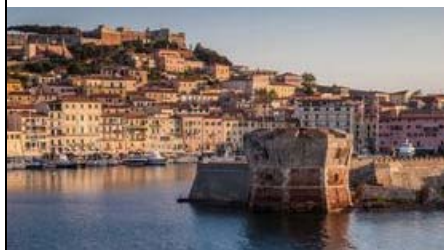
Exploring Tuscany's distant shores on a yacht cruise