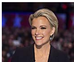
17 facts about FOX News anchor Megyn Kelly PoliticsChatter