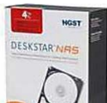
Shop Now - $156.75 $156.75 - newegg.com