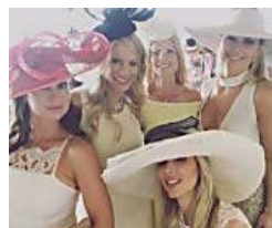
Lindsey Vonn shut down detractors with Derby photo alongside... SportsChatter