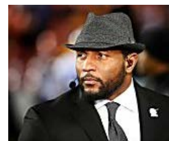
ESPN personalities to leave the network in the past month SportsChatter