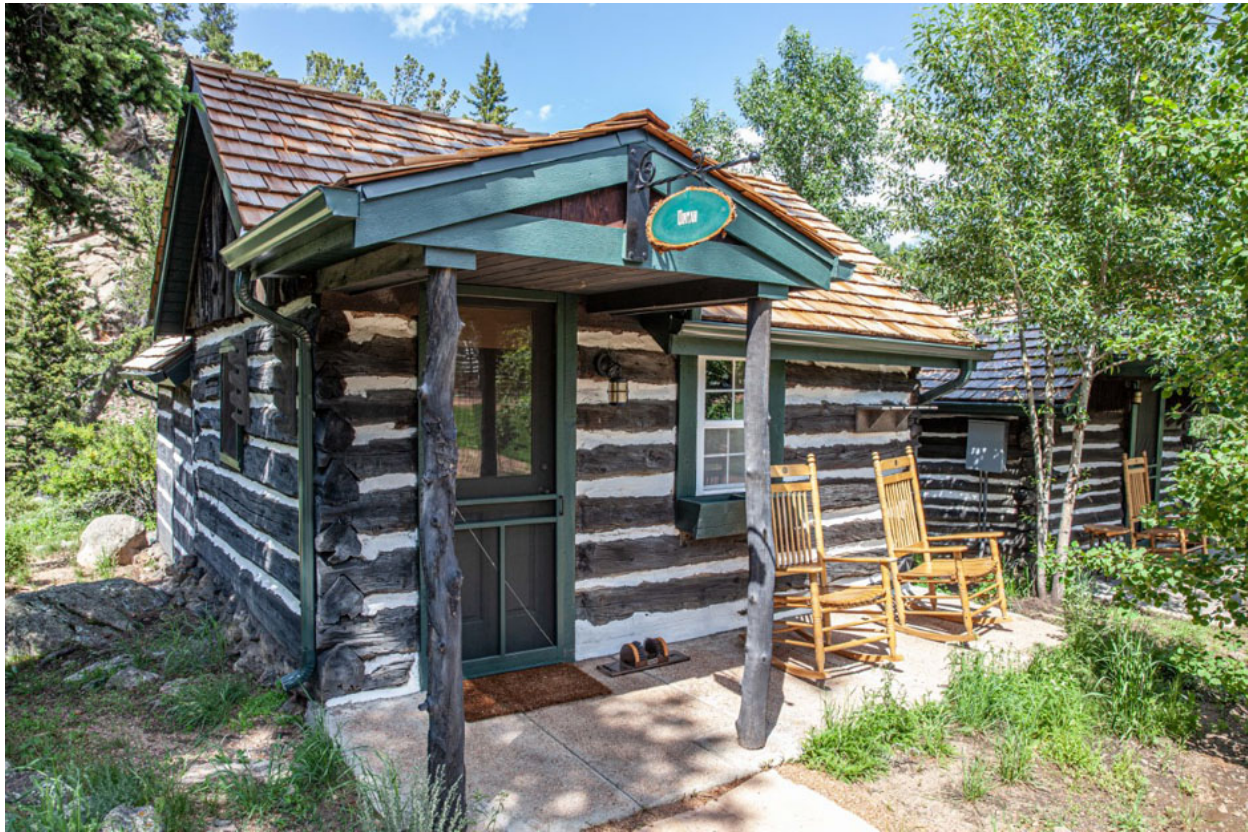
Guest cabins, sleeping two to eight visitors, are clustered around the Lodge and near the river.

alcoholic beverages. Half and full-day rates are also offered. Book at the Broadmoor Hotel, at (866)334-3693, or see www.broadmoor.com .