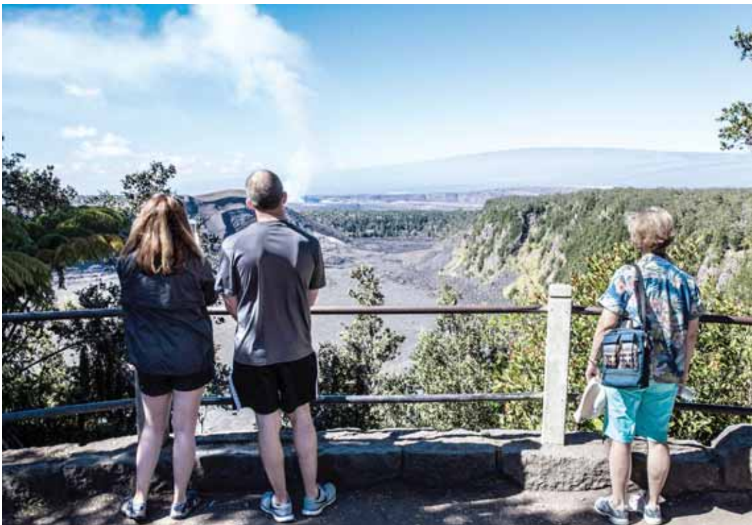
OBSERVATION: The best view of Kilauea Iki Crater, which erupted in November 1959, is from Crater Rim Drive, Volcano National Park, near Hilo, Big Island, Hawaii.