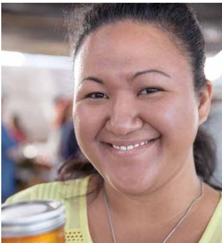
Waokele Honey comes in four flavours at Hilo's twice-weekly Farmers Market, in Hilo, Big Island, Hawaii.