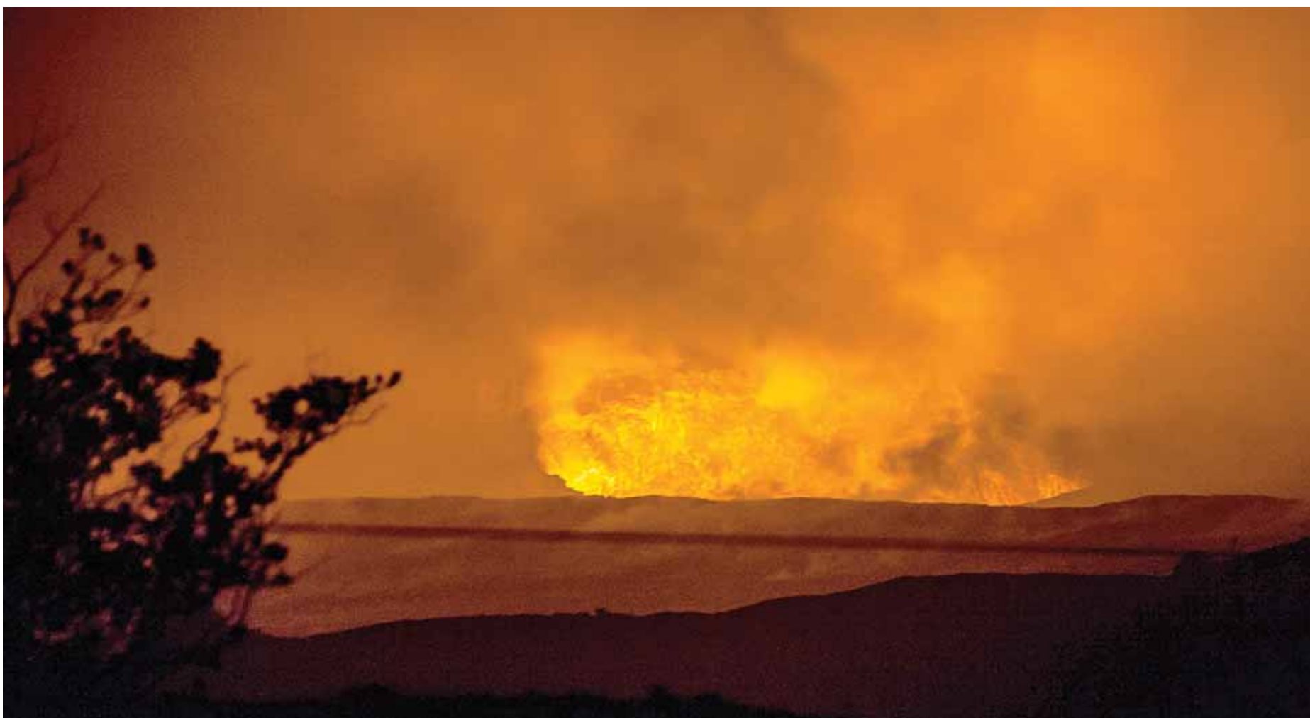
NIGHT VIEW: Fiery red-hot lava in Halemaumau Crater glows in the night at the Volcano National Park, Hilo, Big Island, Hawaii.