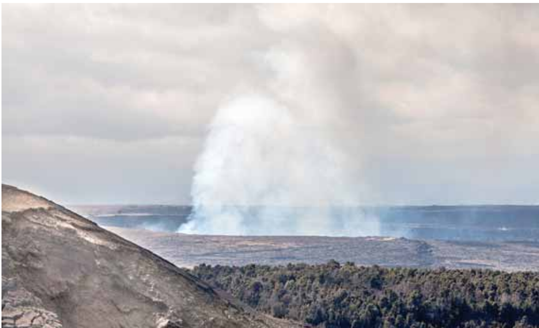
Smokey sulphur dioxide rises from Halemaumau Crater in the Kilauea caldera, Volcano National Park, near Hilo, Big Island, Hawaii.

up at the dock and show them the real Hilo," said Marrow. "We started with one van and when that wasn't enough we bought another one. Now we have 10 new vans and 90 full- and part-time employees. Finally we bought the land and decided to build the zip line."