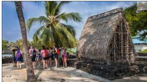
Guided tours at the now-restored City of Refuge (Pu’uhonua O Honaunau National Historic Park), on the south Kona Coast, explore the ... Read More

Unlike Washington, however, Kamehameha the man remains something of a mystery. Though the number of rival chiefs he defeated and the valleys and coastal villages where he pursued each campaign for weeks or months was legion, his reputation rests primarily on oral histories.