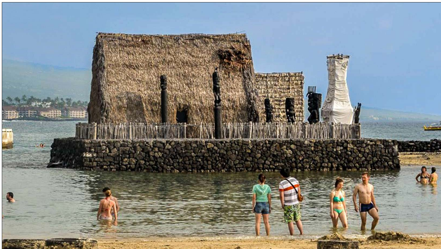
King Kamehameha lived out his last years in the thatched hut and Ahuena Heiau, now restored, in the bay next to the Courtyard King Kamehameha Kona Beach Hotel.