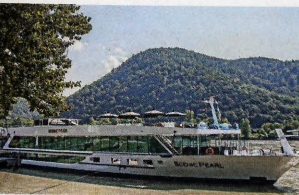
The Pearl is seen at the dock where the Danube River makes a tight S-curve, at the village of Durnstein, Austria, a 10-minute walk uphill.

>> Accommodations: Category D cabins start at $4,180 per person for two in a cabin and include a fly-free option for one airline ticket.