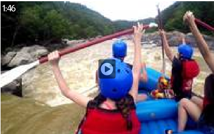
Rafters enjoy the rapids on the French Broad River