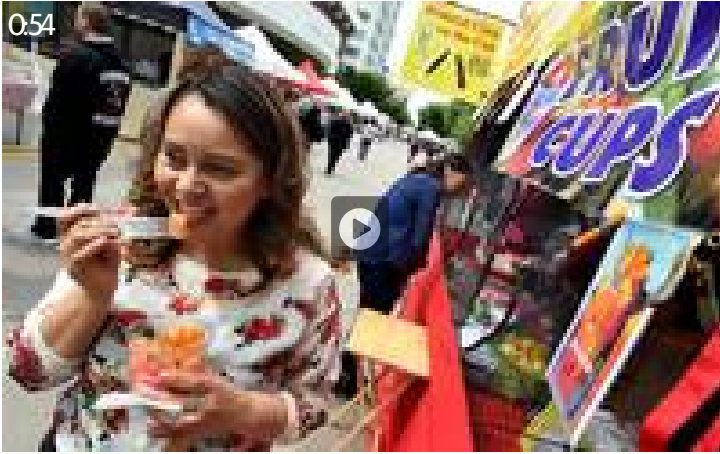
Scenes from the Market on Kern farmers market