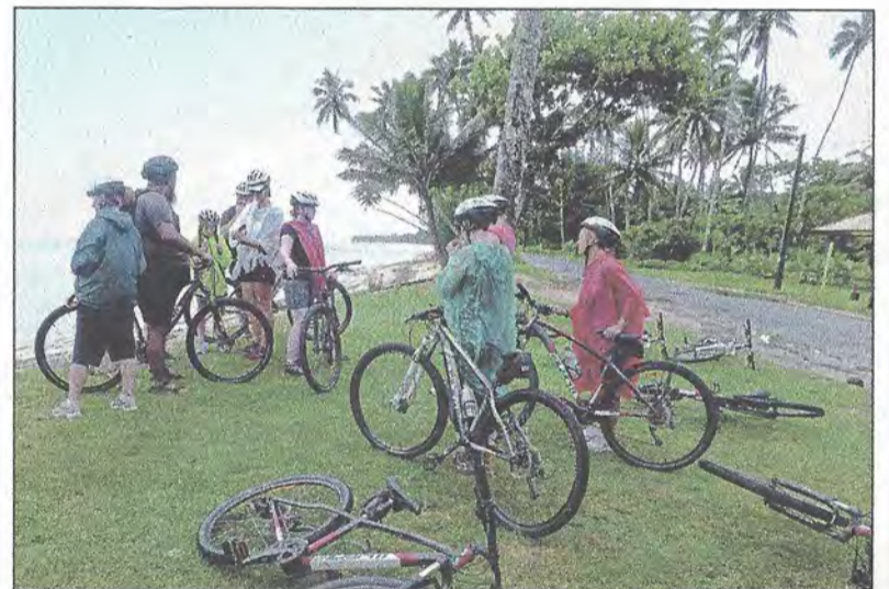
Tropical showers wind up an exhilarating half-day ride with Storytellers Eco Cycle Tours.

It was also time for a just-caught, grilled fish sandwich at one of Rarotonga's many ocean-side cafés, where picnic-table seating guarantees conversation. And so began our education.