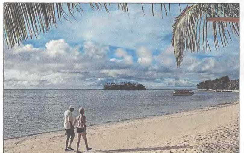
Strolling before breakfast on popular Muri Beach, with motu (islet) Taakoka and the outer reef at rear.

If our table mates happened to be islanders on a lunch break, they described the Cooks' historic connection with New Zealand, where almost everyone has relatives and yearly visits are the norm.