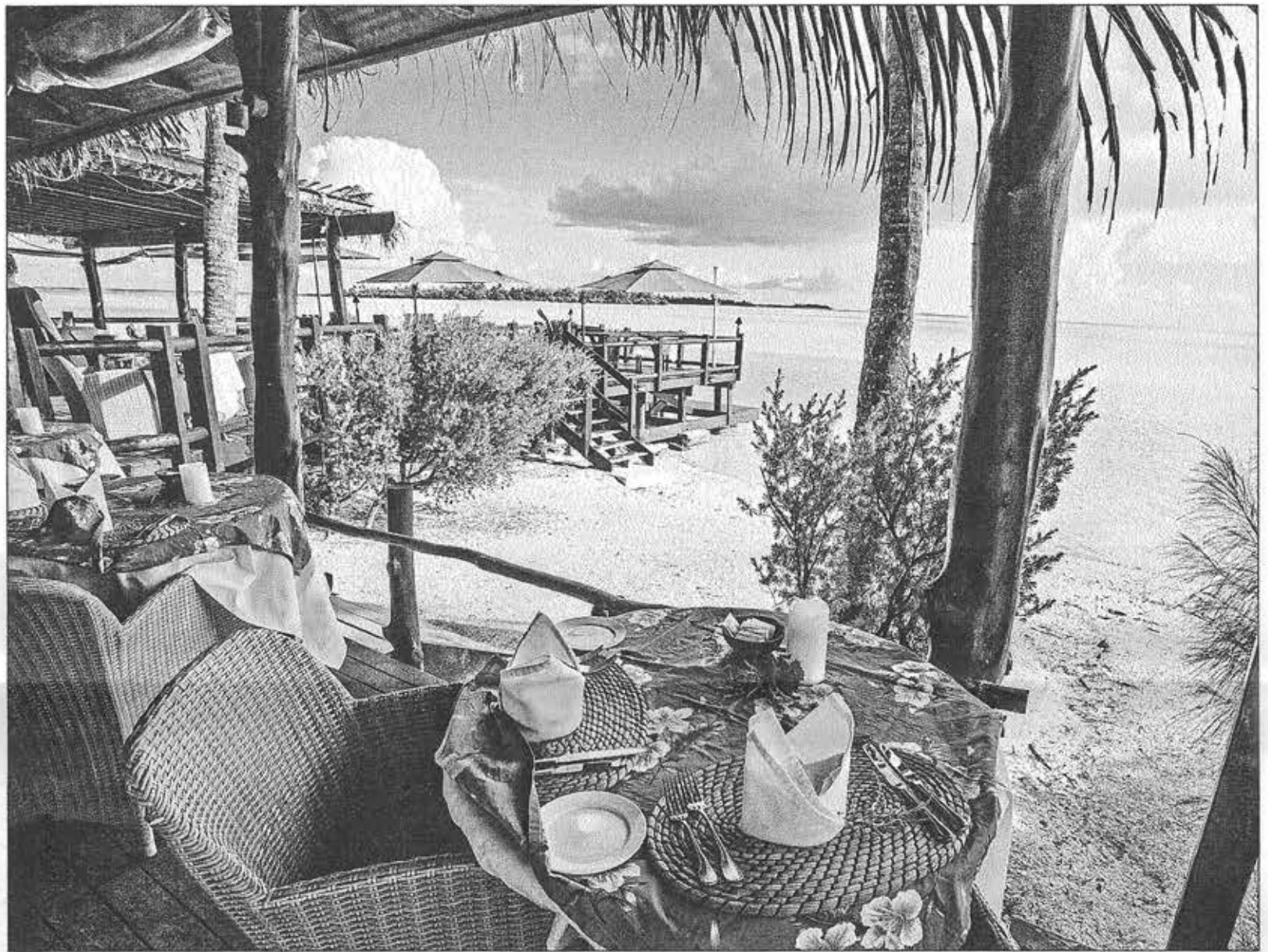
STEVE HAGGERTY, TNS

Piling into Tere's 12-passenger boat we sped south across the lagoon, rounding the motus (islets), searching for coral gardens and stopping to snorkel. And after you've spent a morning in the