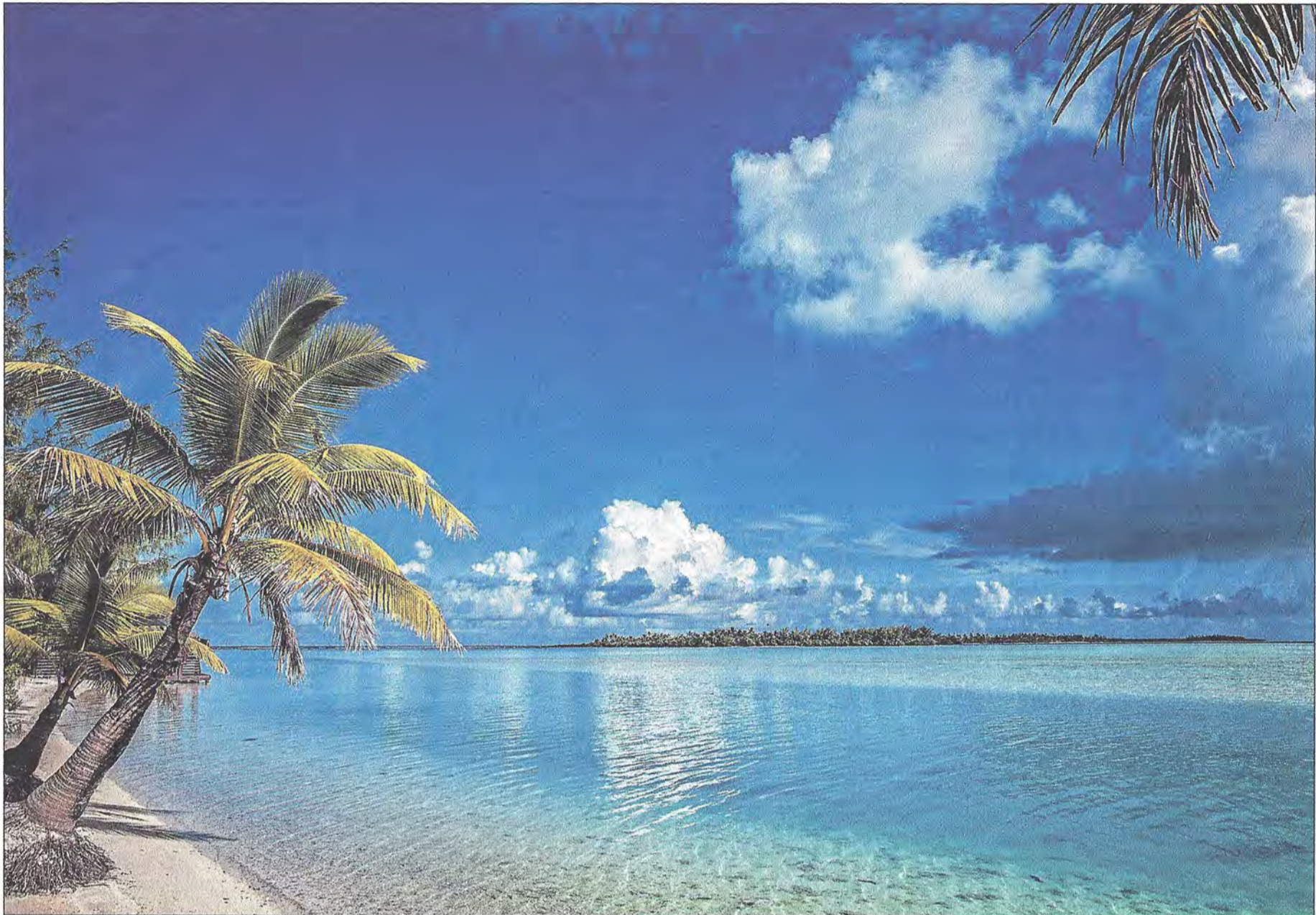
Calm and as clear as glass, Aitutaki Lagoon is the stuff of dreams.