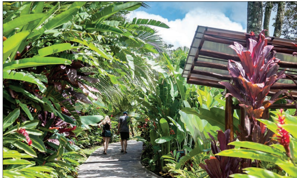
Hike through the grounds at Nayara Springs Resort and get lost in the landscaping, a green with tropical plants and flowers crowding every path, enhancing every pool and flanking every restaurant. The botanical gardens are what make this luxurious, full-service resort so unique.