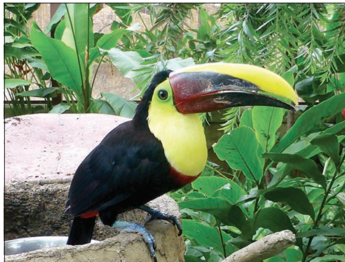
ABOVE: Keel-billed toucans, bright-colored and slow-flying, are easy to spot in dense rainforests like those in the Pacuare River gorge.

Sit at the kitchen counter and "talk ingredients," with the chefs, or "ask about wine pairings." Borrow a kayak or fishing gear and "walk down to the beach." Take a car, to