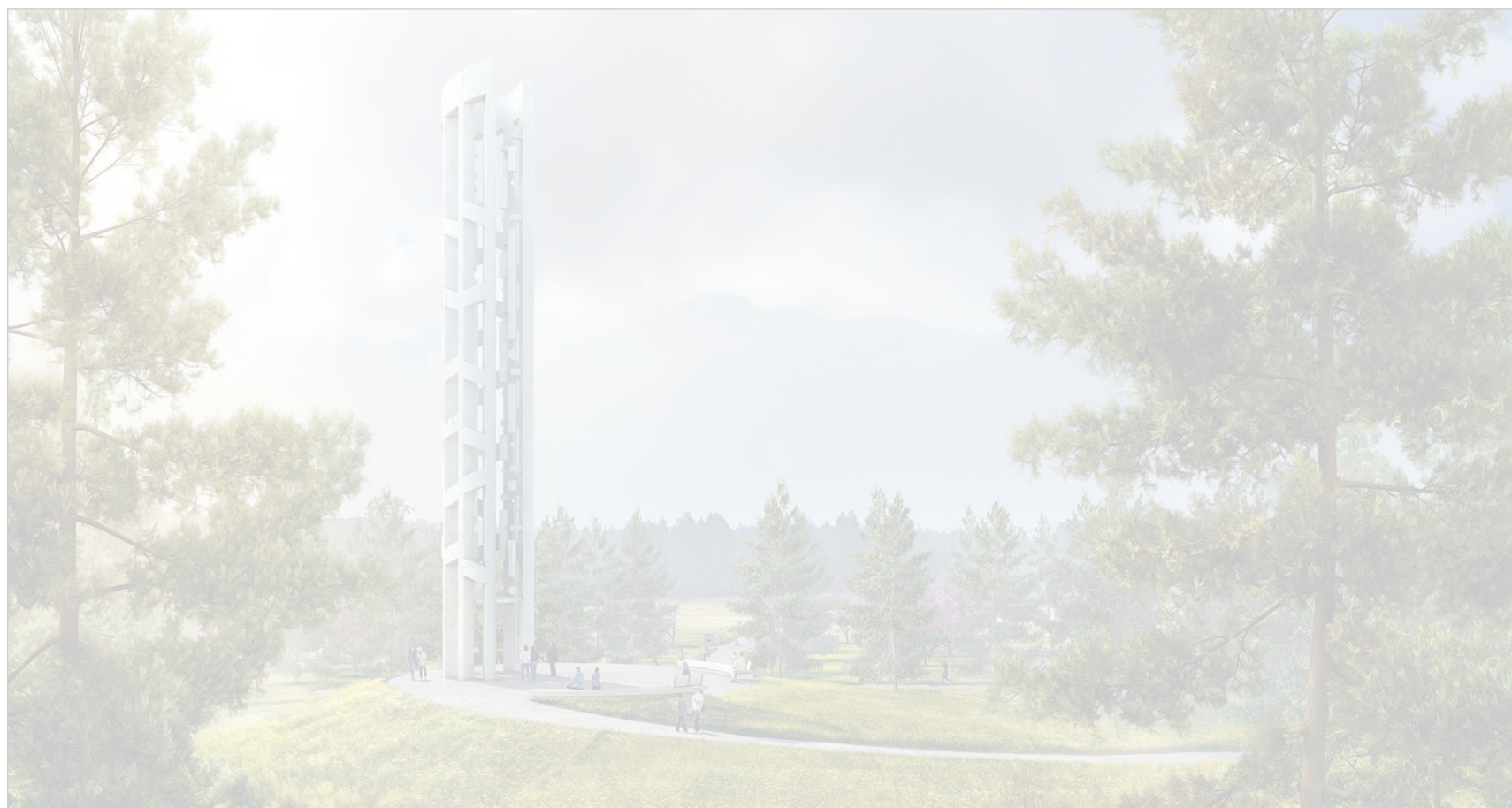
ABOVE: The Tower of Voices, shown in an artist's rendering, is scheduled to open in September at the Flight 93 National Memorial in Stoystown, Pennsylvania. The 93-foot tower will feature 40 chimes, a symbolic representation of the 40 passengers and crew who perished in the 9/11 terror attack.

• In addition to the usual theme park attraction openings — including Toy Story Land at Disney World — a new