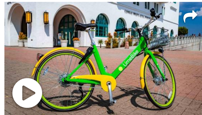
LimeBike: How it works