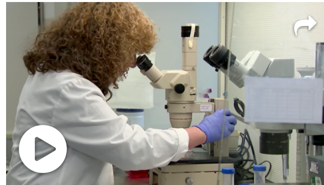
Scientists grow human egg to full maturity outside the body