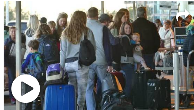
Prepare for CLT's busiest travel day