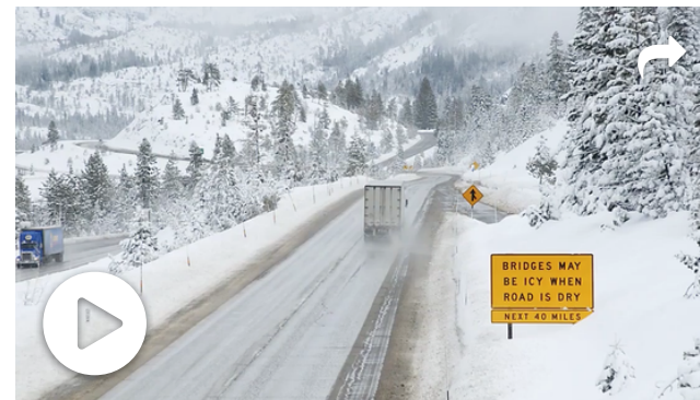
Winter driving tips for motorists heading to higher elevations