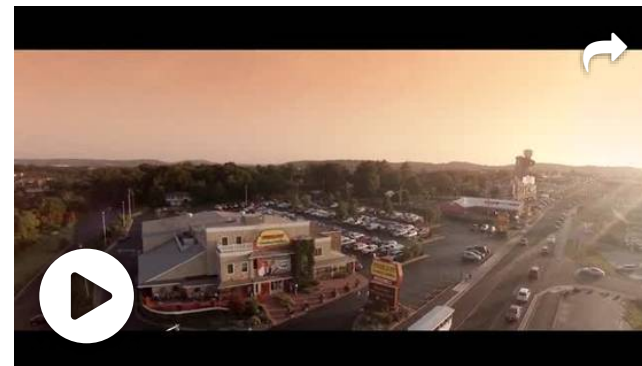
We Are Branson, Missouri