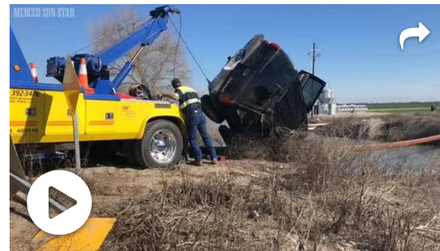
Man dies, children pulled out of vehicle in Merced County crash