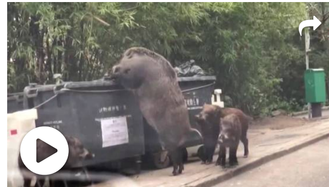
Giant "Hogzilla" wild boar spotted raiding dumpster in Hong Kong