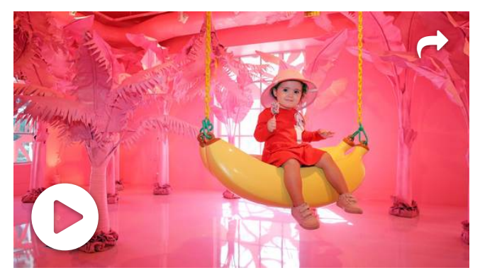
Taste, smell, swing and even swim at this ice cream museum